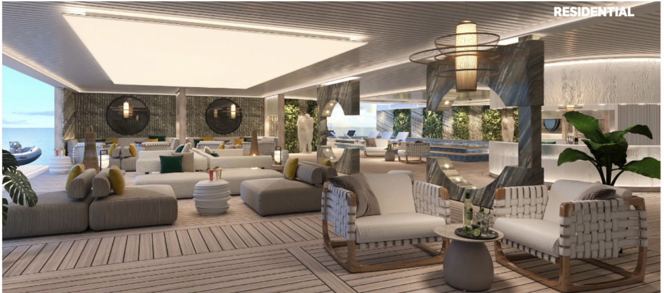
Each deck will have lounges to encourage community.

The team, which boasts a background in real estate, considered acquiring a ship, but decided that the needs of full-time residents required new construction built to Storylines' specifications. The buyers helped a bit, too.